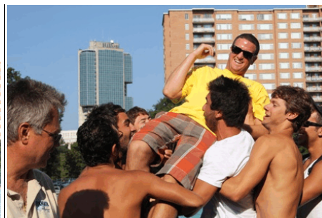
The celebratory dunking of the coach!