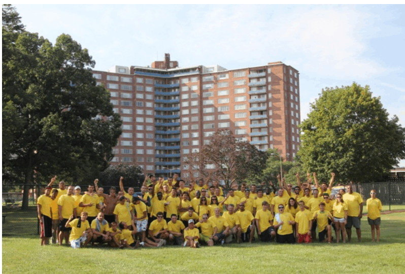
2011 Lifeguard Olympics Participants