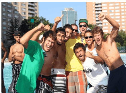
First Place Team

Preference for the indoor, year-round pools will be given to guards that have been with us through the season, have shown up on-time consistently for their shift, kept their pools clean and orderly and who have been willing to fill in as needed.